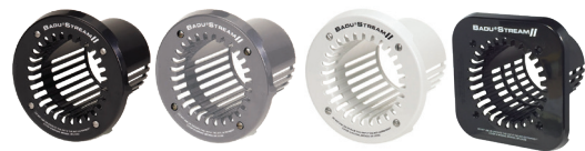
Round covers are available in black, gray and white.