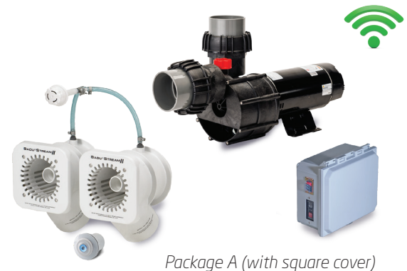
Package A (with square cover)

Consult your physician before attempting any strenuous exercise. This product may not be challenging or satisfying for all levels of exercise.