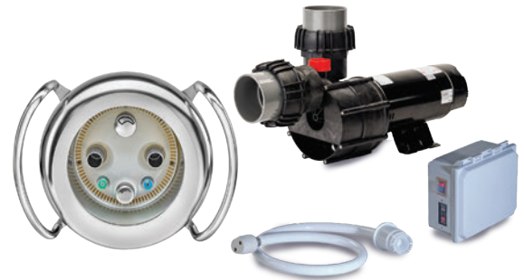
BADUJET Imperial Deluxe