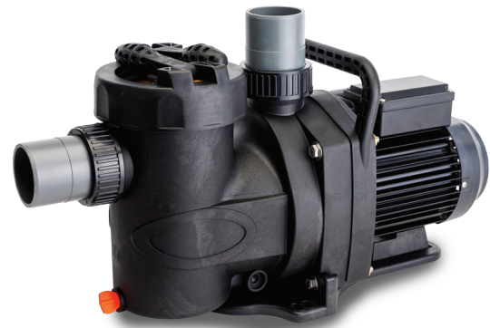
BADU Pro-II E SSD

Our flagship pump, the BADU® Pro was designed with pool service pros in mind. A drop-in replacement for both the Hayward® Super Pump® and Pentair® SuperFlo®, it directly replaces the majority of pumps on the market.